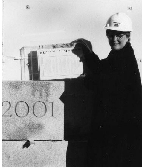
AAS President Ellen Dunlap fills the cornerstone of the new vault with information about the Society in 2001.

During that period, materials will be moved into the new stack area, and a fire suppression system will be installed throughout Antiquarian Hall. The new vault, fitted with compact shelving, will house the collections and workrooms for the newspaper and graphic arts departments as well as the Society's archives and manuscripts collections, first editions, reserve, dated books, and pamphlets, almanacs,